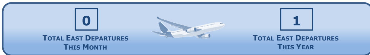
East Departures Yearly Comparison

The number of East Departures may vary from month to month due to weather, air traffic volume, and/or operational factors.