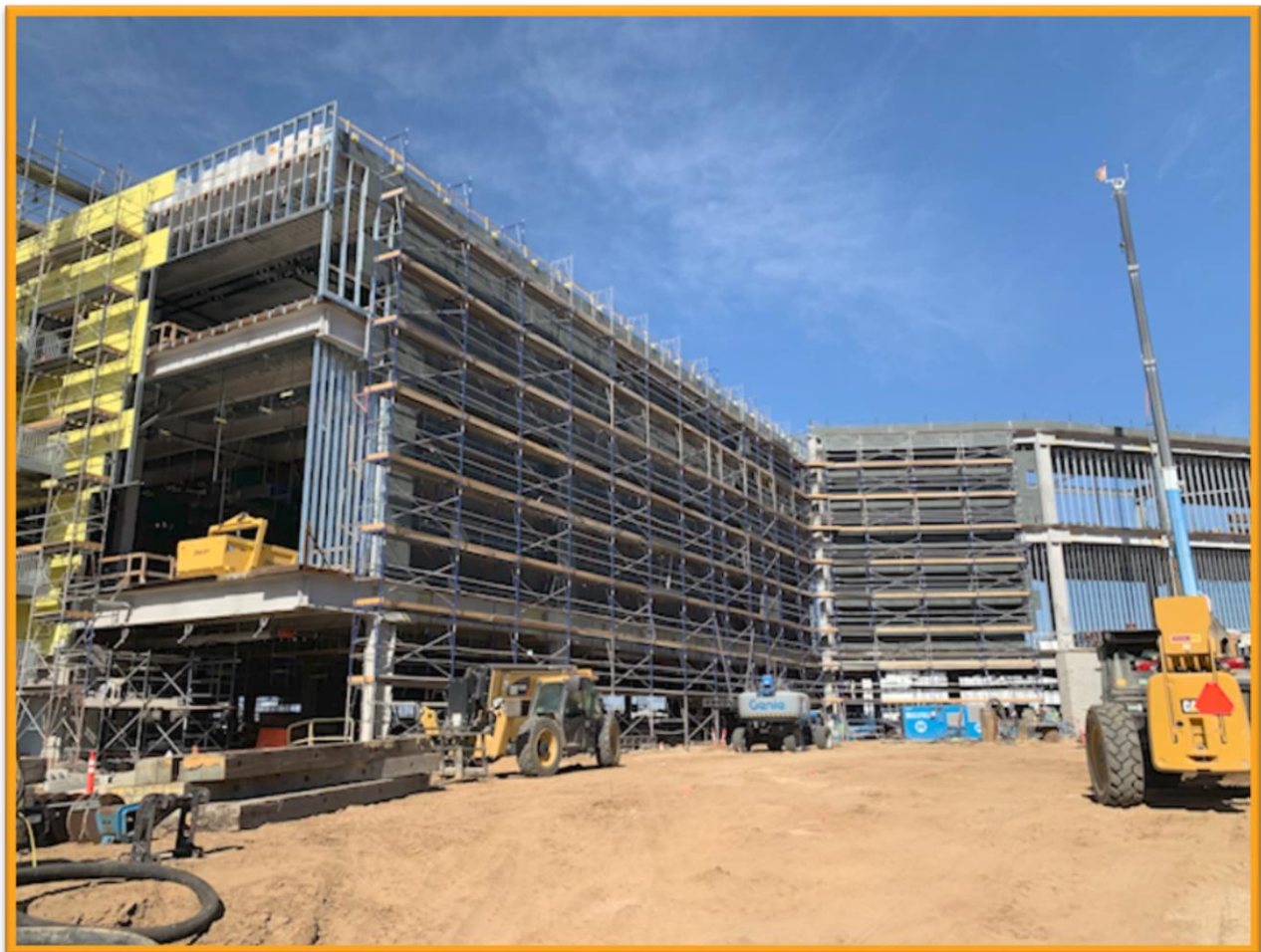
Terminal 2 / 3 Head House (top) and Terminal 3 Concourse construction (bottom)