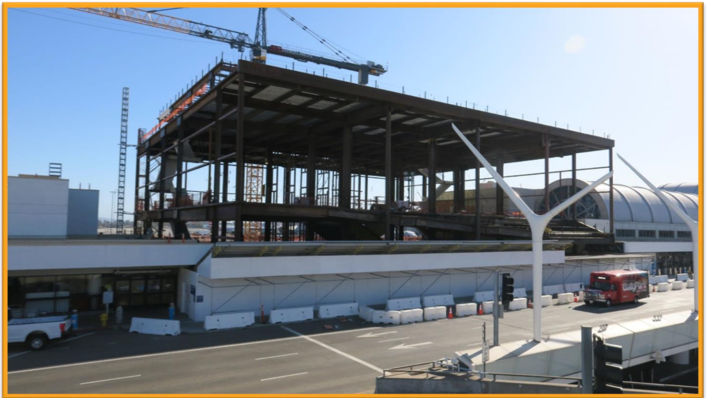
The future Terminal 4.5 Core building takes shape, pictured from Parking Structure 5