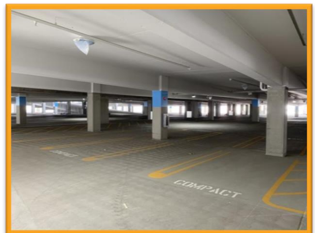
Top: Current ITF-West construction progress; Bottom Left: Rendering of final ITF-West facility; Bottom Right: Inside ITF-West Parking Structure