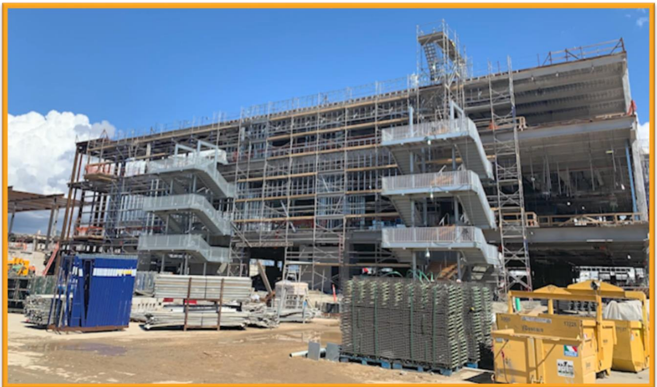
Terminal 3 satellite (top) and concourse (bottom) current construction progress