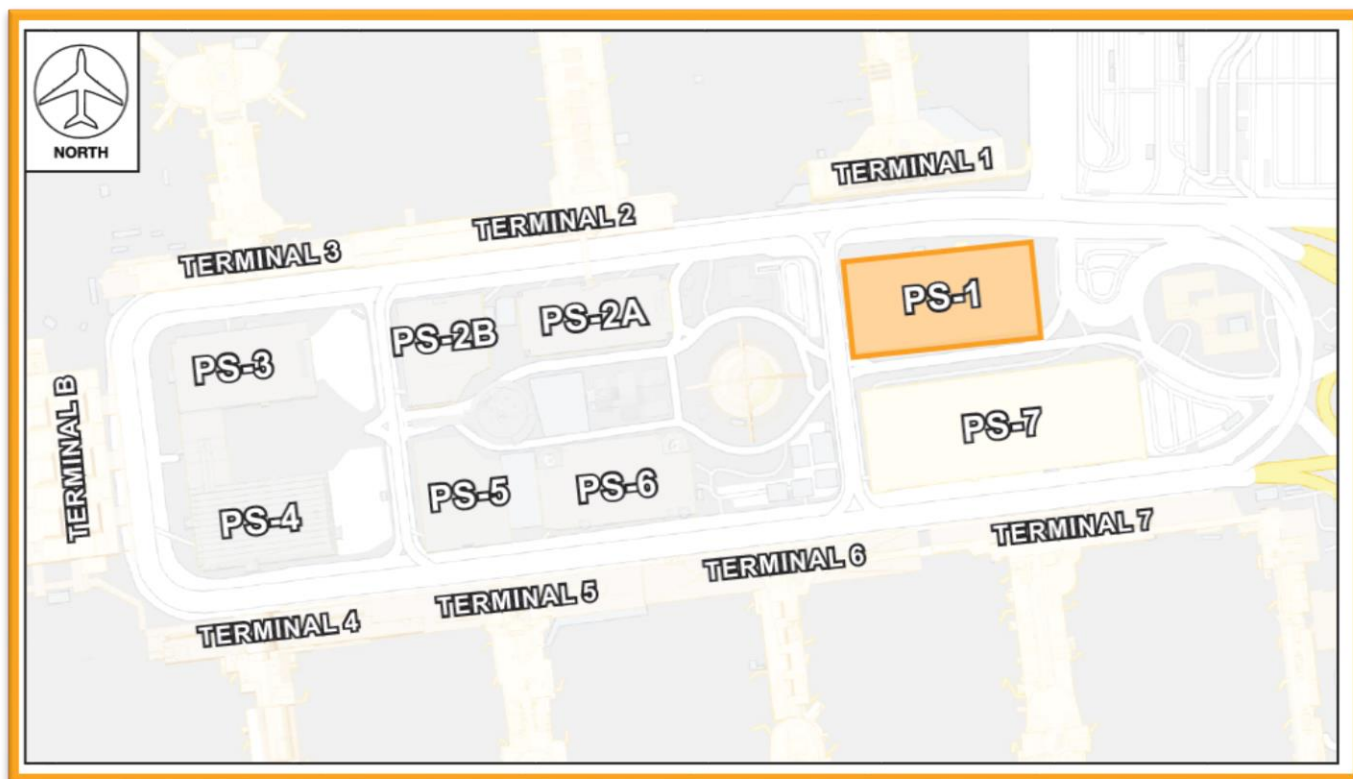
Example of PGS System (top) and Parking Structure 1 location (bottom)