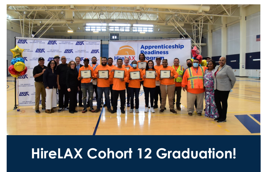
HireLAX Cohort 12 Graduation!